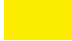
13 1232 Lemon