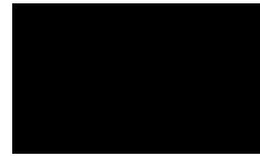
14 1232 Black