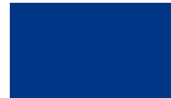
12 1232 Azure