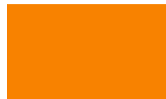
17 1250 Orange