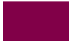
77 1241 Magenta