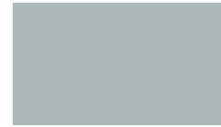
15 1230 Grey