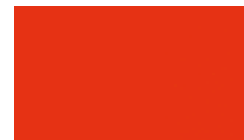
17 1251 Poppy